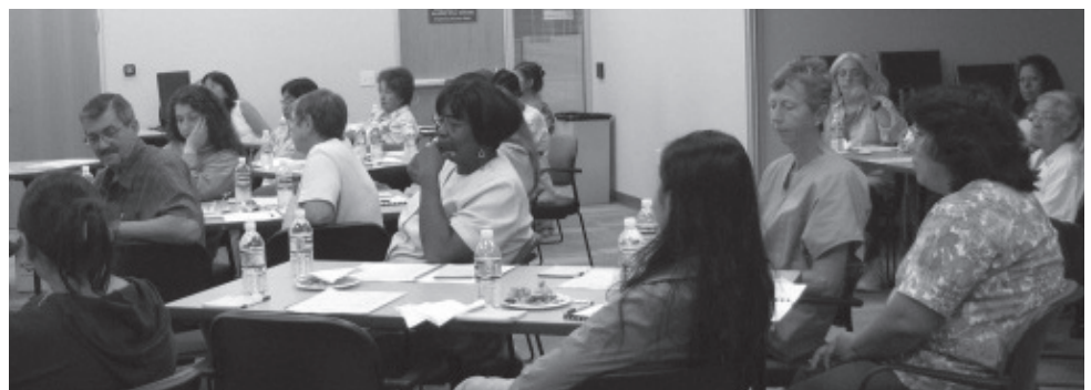
Caregivers in the classroom - building skills and increasing knowledge

The Registry Staff and several IHSS Clients feel the loss of two wonderful caregivers who passed away in 2007.