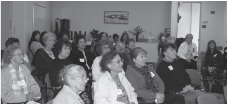
Caregivers and Care Recipients enjoying the Caregiver Recognition events