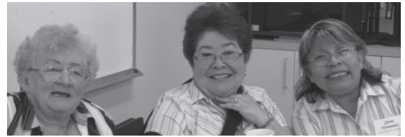
Three caregivers at the Caregiver Reception